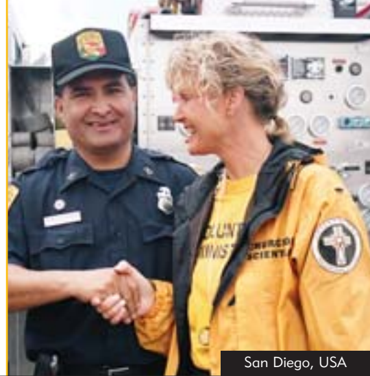
San Diego, USA

Scientology Volunteer Ministers provided thousands of hours of assistance to the fire fighters and victims of fires that swept through Southern California in 2003 and were applauded for their actions by state and national officials, including the mayor of San Diego and the governor of California.