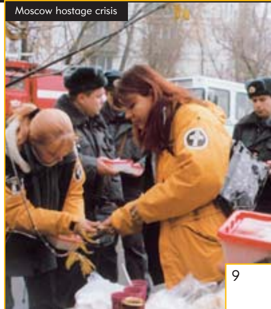
Moscow hostage crisis

120 lives. Moscow’s Volunteer Ministers provided logistical support to rescuers, and administered spiritual assistance to victims and emergency relief teams at both sites.