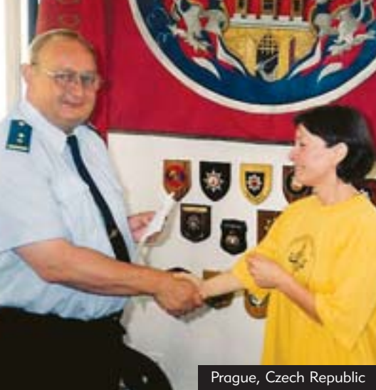
Prague, Czech Republic

Hundreds of Volunteer Ministers across Hungary, Germany and Czech Republic contributed to disaster relief during the devastating floods of 2002. Their effective organising and implementing of relief activities earned acknowledgment from Prague officials (left), who requested their continued assistance after other volunteers returned home.