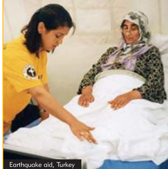
Earthquake aid, Turkey

When a deadly earthquake rolled across western Turkey's heartland in 1999, killing more than 2,000 people and injuring 10,000, local Volunteer Ministers teamed with others from Hungary and Germany to assist the survivors to overcome the tragedy and take back their lives.