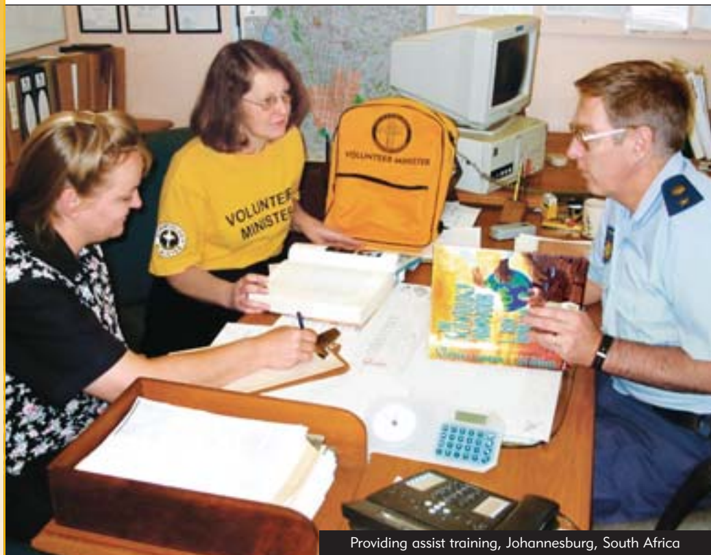
Providing assist training, Johannesburg, South Africa

O n 28 May 1995, Sakhalin Island on the Pacific coast of Russia was violently hit by an earthquake with a magnitude of 7.6. The northern city of Neftegorsk was almost completely destroyed; the death toll a devastating 60 percent,