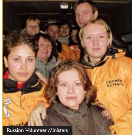
Russian Volunteer Ministers

The plight of several thousand women, children and old men waiting out the Chechnyan war in the tent cities of Ingushetia has been eased by the arrival of teams of Russian Volunteer Ministers — bringing relief, courage and new hope to the inhabitants.