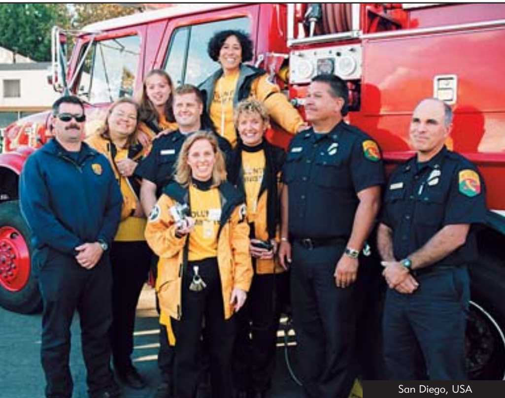
San Diego, USA

“They are by far the most professional and dedicated volunteer group I have ever seen.”