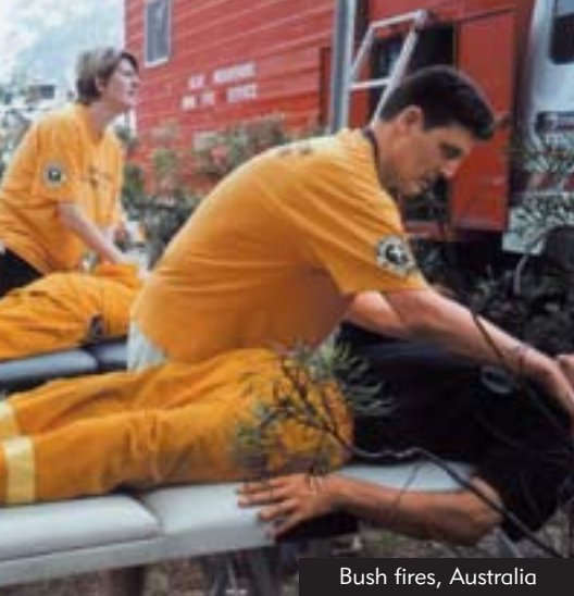
Bush fires, Australia

Scientology Volunteer Ministers worked alongside fire fighters combating bush fires that burned 12 million acres in Australia. Providing relief-giving assists, the volunteers were soon requested by fire department officials to train their own staff on the procedures. When earthquakes in Colombia left 10,000 homeless, Volunteer Minister teams provided spiritual assistance to the traumatised and helped distribute water and supplies (below).