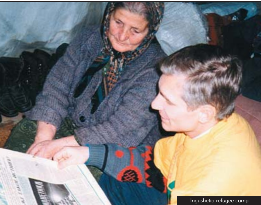
Ingushetia refugee camp

“I consider the work of [the Volunteer Ministers] group very necessary and useful.”