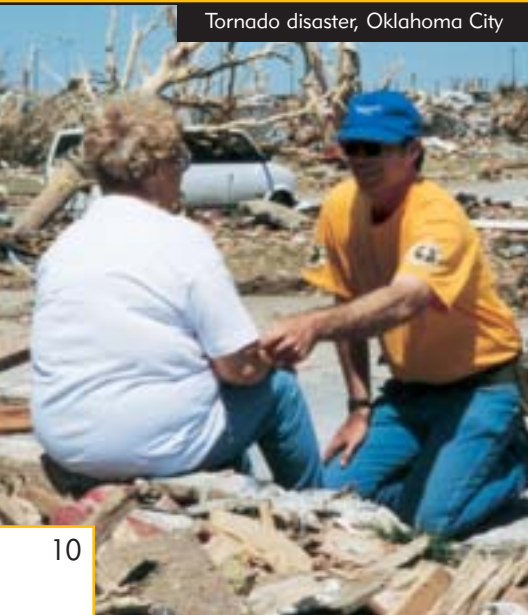
Tornado disaster, Oklahoma City

and to help those who had lost their homes find shelter.