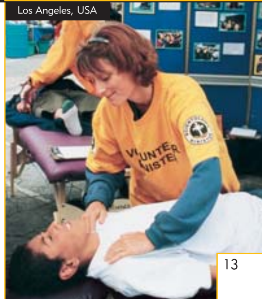
Los Angeles, USA