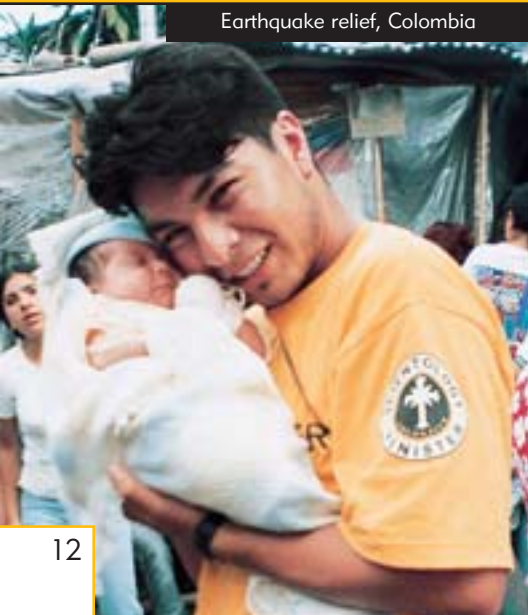
Earthquake relief, Colombia